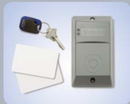
Outdoor Prox-Tag Reader - Disarm the system before entering the building