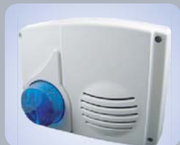
Outdoor Siren/Strobe - Improve police response and deterrence