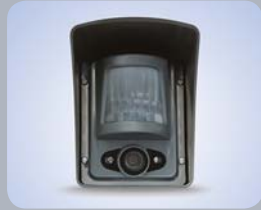
Outdoor MotionViewer - Secure detached garages, porches, patios and storage sheds