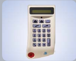
Wireless Keypad - This is an arming/disarming device also for programming the XL700.