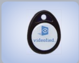
Badge - Proximity Arming Tag