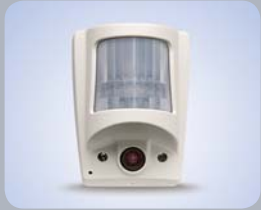
Indoor MotionViewer - Additional security where you need it

Upgrade your system Add up to 24 devices to customize your system