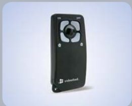
Remote Control - Battery powered remote arming